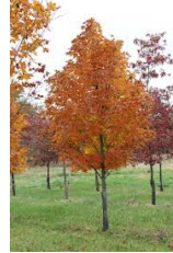
Legacy Sugar Maple